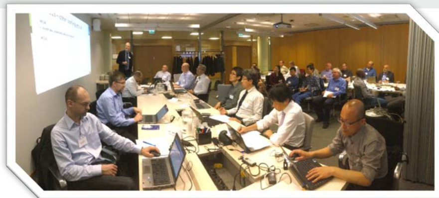
TC 12/P1 meeting (electricity meters), May 2019, Helsinki.